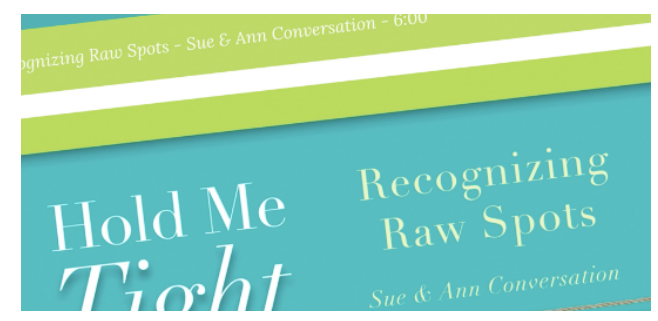
Insightful videos from relationship and attachment science experts

And there's more. Visit HoldMeTightOnline.com to register, and learn to shape and repair your relationship today.