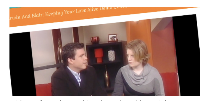
Videos of couples working through Hold Me Tight converations