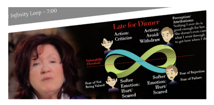
Teaching pieces directly from me

This interactive program applies our 30 years of research and practice and a cuttingedge understanding of love relationships. The program has 8 chapters with: